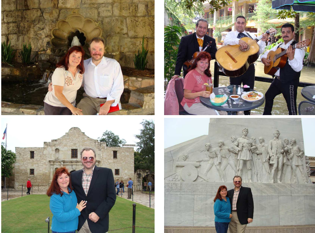
Figure 5: In San Antonio at the IEEE International Conference on Systems, Man and Cybernetics. The top two photos are on the river walk. The strolling mariachi bands are fun. The bottom two pictures were taken while we visited the Alamo.