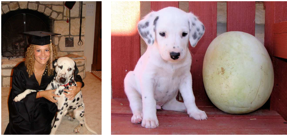
Figure 10: LEFT: Marilee and Rorschach. RIGHT: One of Rorschach's brothers born this year in a different litter. Next to him is a watermelon grown in our garden.