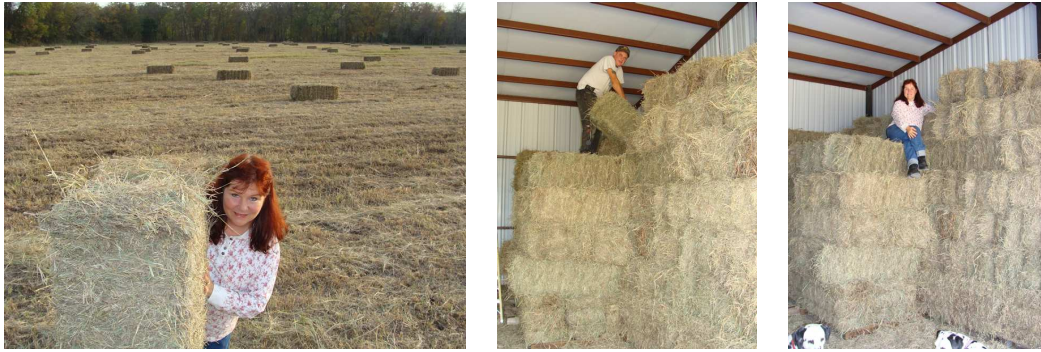
Figure 9: Making hay!