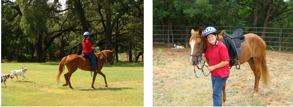
Figure 2: Esperanza and me!